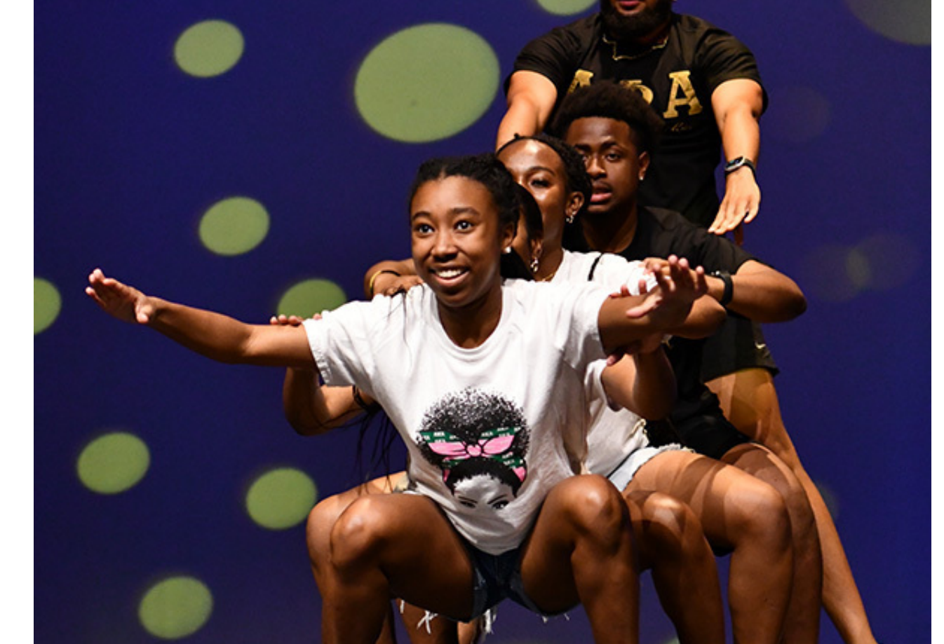
If you missed StompFest, you missed one of the most smile-inducing productions of the year! Click on the image above to see just a glimpse of the children's, high school, and Baylor

groups who made this show such an amazing BU tradition.