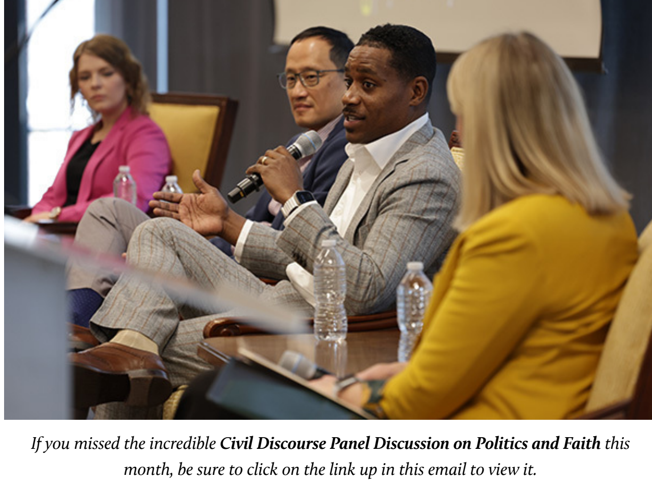
If you missed the incredible Civil Discourse Panel Discussion on Politics and Faith this month, be sure to click on the link up in this email to view it.