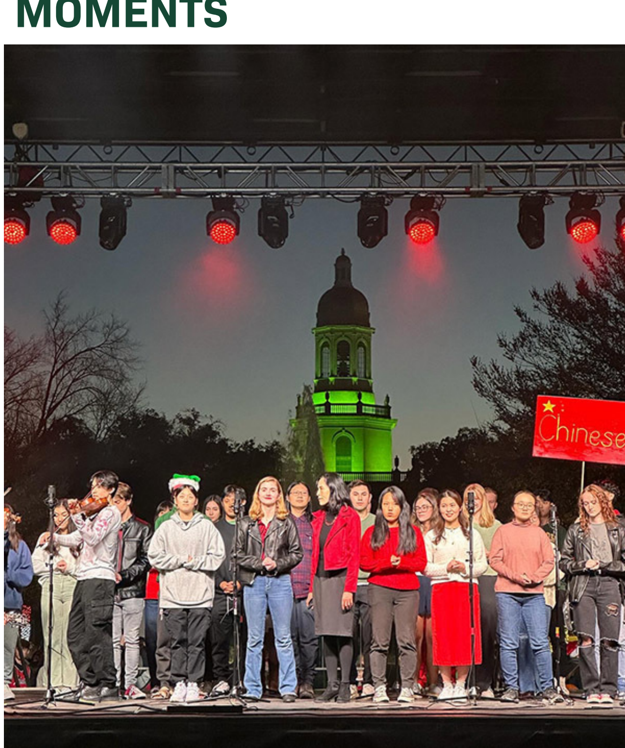
Despite the pivot, Christmas on 5th Street was an amazing success and showcased Baylor Christmas spirit to thousands of students and guests. Pictured is one of the many groups of students performing Christmas carols in foreign languages, in this case Chinese.