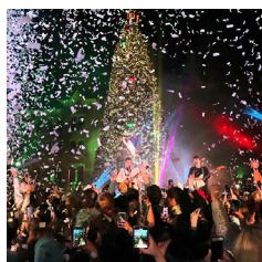
Christmas on 5th

And don't forget Pigskin Revue (Fall), highlighting the best Sing acts from the previous year.